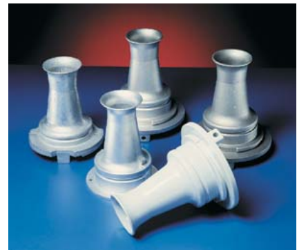
MikroPul maintains a large inventory of venturis for most applications

Venturis are available in carbon steel, stainless steel, and aluminum, with some designs available in Inconel. Finishes available include epoxy, electro-galvanized, nickel, Teflon®, and other special platings and coatings.