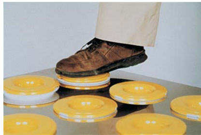
Pop-Top bag and cage assemblies change out easily and quickly